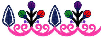
File: 1 small lace.jef Stitches: 4431 Size: 128.1x45.4 mm