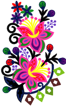
File: butto.jef Stitches: 15553 Size: 95.6x152.8 mm