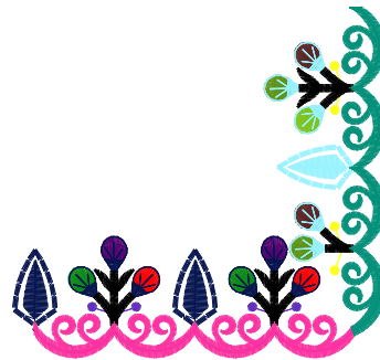
File: corner.jef Stitches: 8301 Size: 139.6x131.2 mm