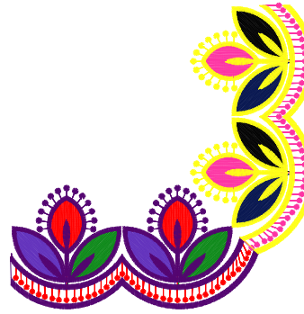
File: corner.jef Stitches: 14989 Size: 136.6x137.4 mm