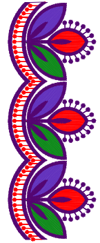
File: small lace.jef Stitches: 10782 Size: 55.6x151.4 mm