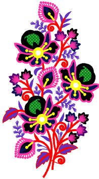
File: butto.jef Stitches: 24961 Size: 116.0x207.1 mm