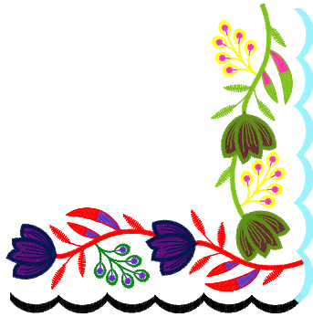
File: corner.jef Stitches: 10336 Size: 132.0x132.2 mm