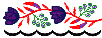
File: small lace.jef Stitches: 5733 Size: 130.8x44.8 mm