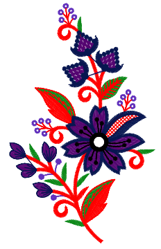
File: butto.jef Stitches: 10508 Size: 90.8x150.4 mm