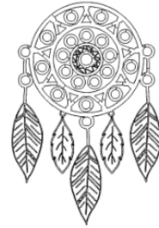
File: 5x7 dream catcher line.JEF Stitches: 17565 Colors: 1 Size: 119.0 x 177.4 mm Stops: 0