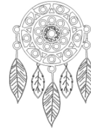
File: 6x10 dream catcher line.JEF Stitches: 21528 Colors: 1 Size: 158.0 x 235.8 mm Stops: 0

This documentation was created with Embird Plus software registered to Deanna Gunn. For more information regarding Embird Plus please visit web site at http://www.embird.com .