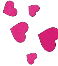
File: Five hearts 5x7.PES Stitches: 8538 Size: 128.0 x 143.8 mm