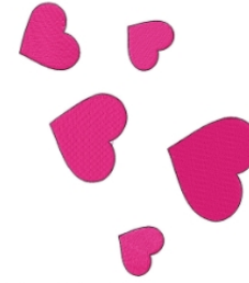
File: Five hearts 6x10.PES Stitches: 12319 Size: 157.0 x 179.0 mm